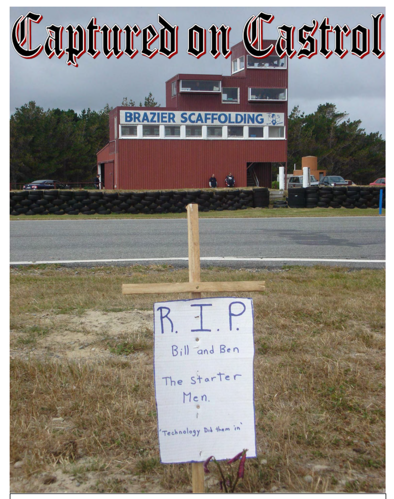
A tongue in cheek message from our hard working Start/Finish Line crew upon the arrival of our flash new lights – God is Watching. (By the way – what's that strange building in the background???)